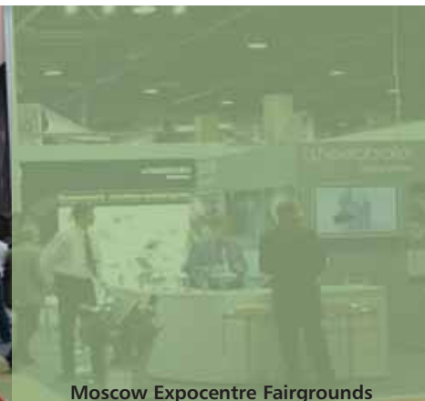
Moscow Expocentre Fairgrounds

About 300 companies from 29 countries exhibited at the Litmach event